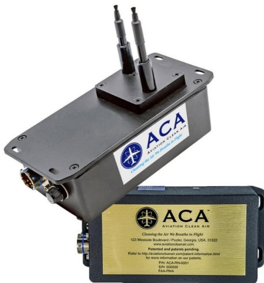
Figure 1: ACA NPBI™ Unit Weighs Only 1.34 lbs, Unit Dimensions are 7.02" x 3.27" x 5.36" (w/Probes Extended)

The Peregrine developed Supplemental Type Certificate (STC) and Approved Model List (AML) for the installation of Aviation Clean Air (ACA) Airborne Air and Surface Purification System. This active pathogen disinfection technology, including the neutralization of the COVID-19 virus, is now available for the Bombardier Challenger Series 600 models CL-600-1A11 (600), CL-600-2A12 (601), CL-600-2B16, Dassault models Mystere-Falcon 50, Mystere-Falcon 900, Falcon 900EX, Gulfstream models G-IV and G-IVSP aircraft. The system installation data, STC ST01066DE and AML for these popular business aircraft is now available from Peregrine.